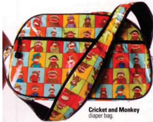
Cricket and Monkey diaper bag.